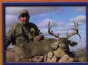
2006 Coues Deer Winner