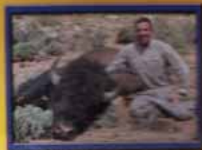
2006 Buffalo Winner

YOU CAN HUNT ARIZONA'S BIG GAME SPECIES FOR 365 DAYS!