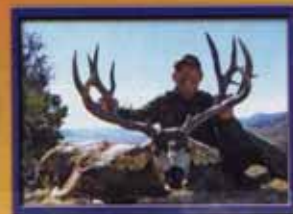
2006 Mule Deer Winner

YOU CAN HUNT ARIZONA'S BIG GAME SPECIES FOR 365 DAYS!