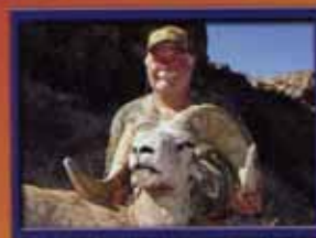
2006 Desert Bighorn Sheep Winner